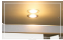
Walkway lighting in the cellar