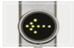
LED indicator of way direction

By means of an extra foundation frame RF01, the turnstile can even be installed on an unstable ground.