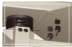
Turnstile mechanical unlocking