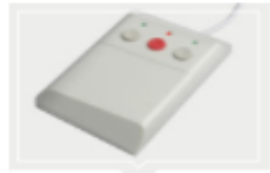
Control panel for remote management