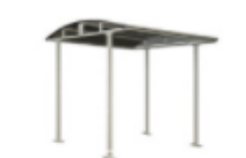
Special protecting apron for full height turnstile